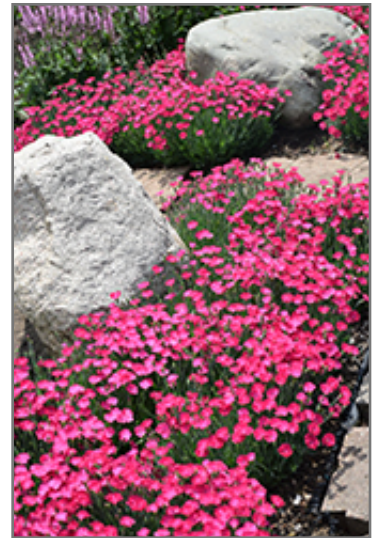
Paint The Town Magenta Pinks in bloom

Paint The Town Magenta Pinks is an herbaceous evergreen perennial with a mounded form. It brings an extremely fine and delicate texture to the garden composition and should be used to full effect.