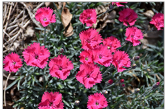
Paint The Town Magenta Pinks flowers