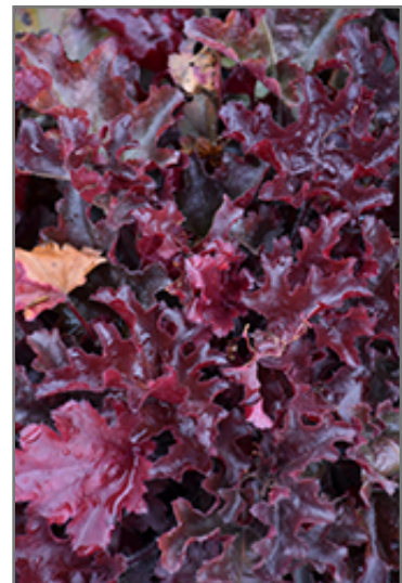
Dolce Cherry Truffles Coral Bells foliage