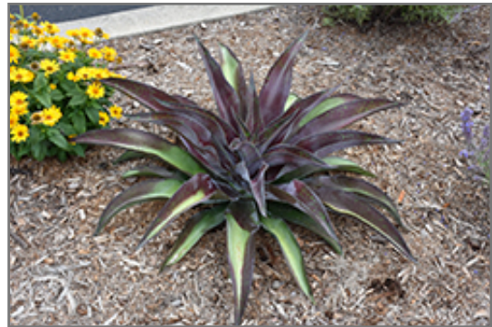
Mission to Mars Mangave

Mission to Mars Mangave is recommended for the following landscape applications;