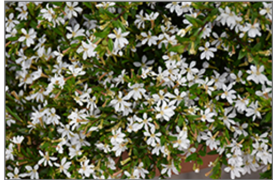
FloriGlory Maria Mexican Heather flowers

FloriGlory Maria Mexican Heather is recommended for the following landscape applications;