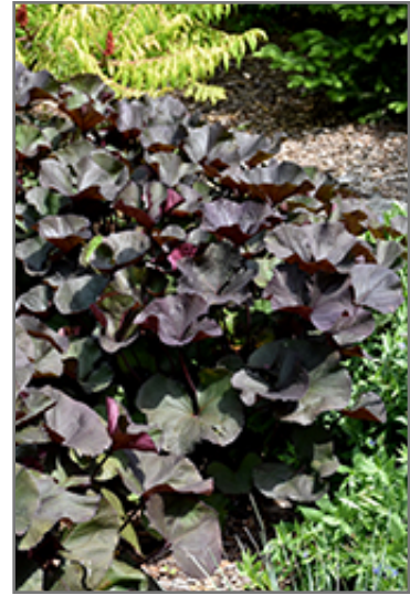
Britt Marie Crawford Rayflower foliage

This plant does best in partial shade to shade. It prefers to grow in moist to wet soil, and will even tolerate some standing water. It is not particular as to soil pH, but grows best in rich soils. It is somewhat tolerant of urban pollution. This is a selected variety of a species not originally from North America. It can be propagated by division; however, as a cultivated variety, be aware that it may be subject to certain restrictions or prohibitions on propagation.