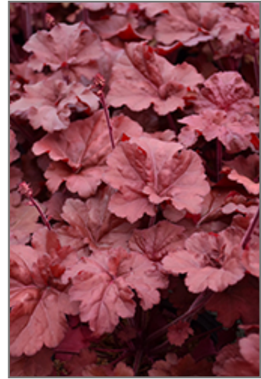
Primo Mahogany Monster Coral Bells foliage

Primo Mahogany Monster Coral Bells is a dense herbaceous evergreen perennial with tall flower stalks held atop a low mound of foliage. Its relatively fine texture sets it apart from other garden plants with less refined foliage.