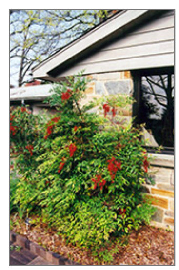
Nandina fruit