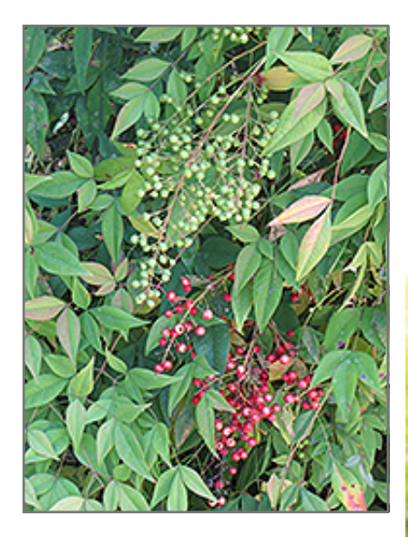
Nandina fruit