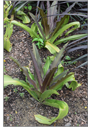
African Night Pineapple Lily

African Night Pineapple Lily will grow to be about 24 inches tall at maturity extending to 3 feet tall with the flowers, with a spread of 4 feet. When grown in masses or used as a bedding plant, individual plants should be spaced approximately 3 feet apart. Its foliage tends to remain dense right to the ground, not requiring facer plants in front. It grows at a medium rate, and under ideal conditions can be expected to live for approximately 10 years. As an herbaceous perennial, this plant will usually die back to the crown each winter, and will regrow from the base each spring. Be careful not to disturb the crown in late winter when it may not be readily seen!