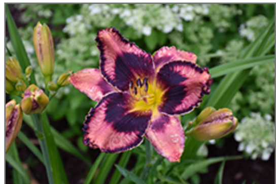
Rainbow Rhythm Storm Shelter Daylily flowers