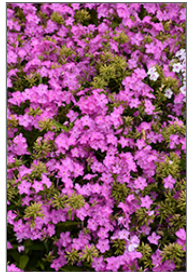
Opening Act Ultrapink Phlox flowers