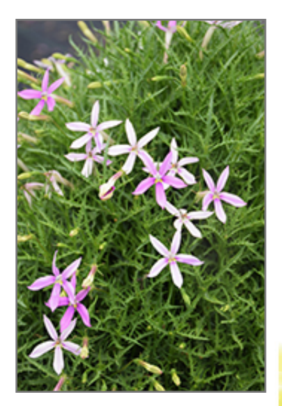
Patti's Pink Isotoma flowers