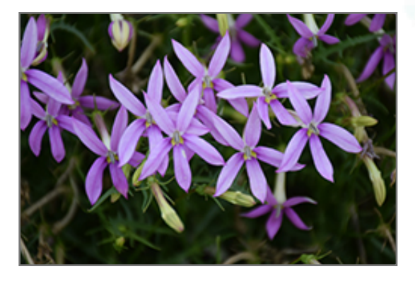
Patti's Pink Isotoma flowers

Patti's Pink Isotoma is recommended for the following landscape applications;