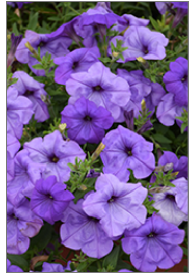
Evening Scentsation Petunia flowers

This plant will require occasional maintenance and upkeep. Trim off the flower heads after they fade and die to encourage more blooms late into the season. It is a good choice for attracting butterflies and hummingbirds to your yard, but is not particularly attractive to deer who tend to leave it alone in favor of tastier treats. It has no significant negative characteristics.