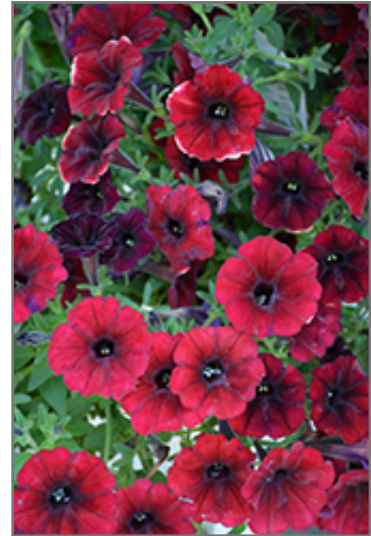
Supertunia Black Cherry Petunia flowers

Supertunia Black Cherry Petunia is a dense herbaceous annual with a trailing habit of growth, eventually spilling over the edges of hanging baskets and containers. Its medium texture blends into the garden, but can always be balanced by a couple of finer or coarser plants for an effective composition.