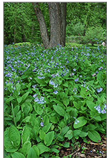
Virginia Bluebells in bloom