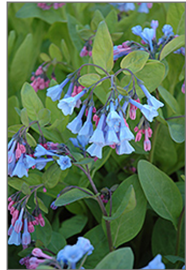
Virginia Bluebells flowers