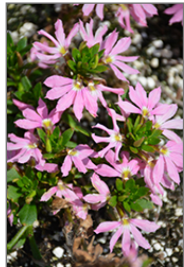
Surdiva Classic Pink Fan Flower flowers