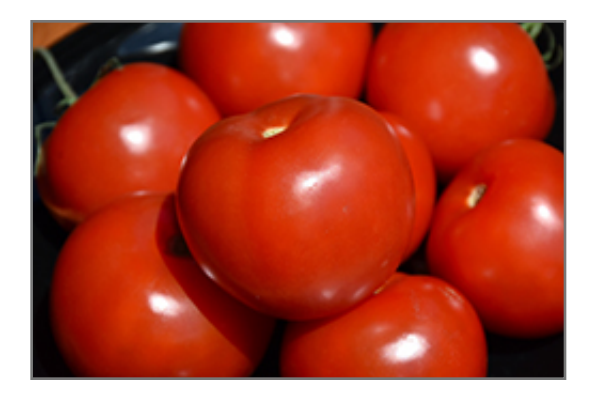
Mountain Merit Tomato fruit