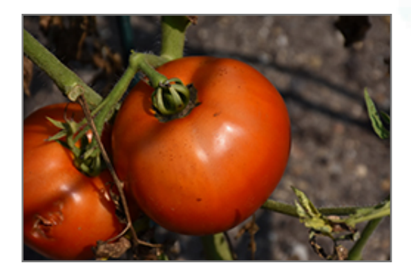
Mountain Merit Tomato fruit