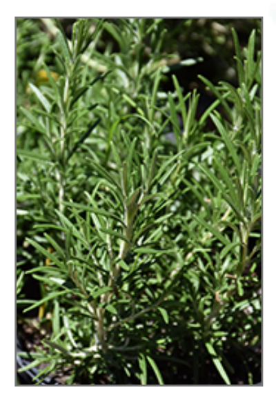
Hill Hardy Rosemary foliage

Hill Hardy Rosemary features dainty spikes of lightly-scented blue flowers at the ends of the branches from late spring to mid summer. It has attractive dark green evergreen foliage. The fragrant needles are highly ornamental and remain dark green throughout the winter.