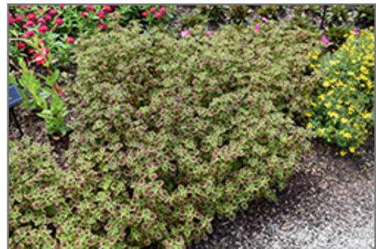
ColorBlaze Chocolate Drop Coleus