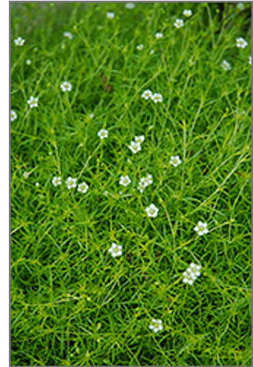
Scotch Moss flowers