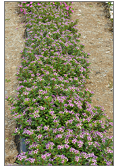
Soiree Kawaii Blueberry Kiss Vinca in bloom

Soiree Kawaii Blueberry Kiss Vinca is a fine choice for the garden, but it is also a good selection for planting in outdoor containers and hanging baskets. Because of its trailing habit of growth, it is ideally suited for use as a 'spiller' in the 'spiller-thriller-filler' container combination; plant it near the edges where it can spill gracefully over the pot. Note that when growing plants in outdoor containers and baskets, they may require more frequent waterings than they would in the yard or garden.