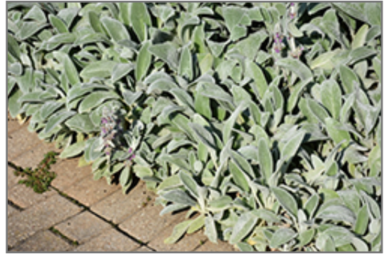
Lamb's Ears

Lamb's Ears will grow to be about 12 inches tall at maturity extending to 24 inches tall with the flowers, with a spread of 18 inches. When grown in masses or used as a bedding plant, individual plants should be spaced approximately 15 inches apart. Its foliage tends to remain dense right to the ground, not requiring facer plants in front. It grows at a fast rate, and under ideal conditions can be expected to live for approximately 10 years. As an herbaceous perennial, this plant will usually die back to the crown each winter, and will regrow from the base each spring. Be careful not to disturb the crown in late winter when it may not be readily seen!