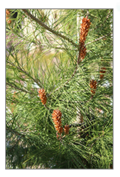
Japanese Black Pine fruit

This tree should only be grown in full sunlight. It prefers dry to average moisture levels with very well-drained soil, and will often die in standing water. It is not particular as to soil type or pH, and is able to handle environmental salt. It is highly tolerant of urban pollution and will even thrive in inner city environments. This species is not originally from North America.