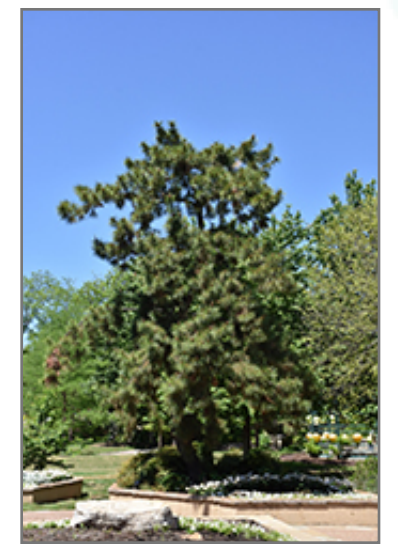
Japanese Black Pine