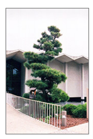
Japanese Black Pine (topiary form)