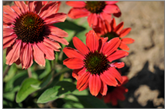
Color Coded Frankly Scarlet Coneflower flowers