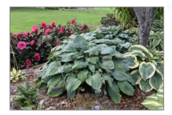
Shadowland Diamond Lake Hosta

Shadowland Diamond Lake Hosta is recommended for the following landscape applications;