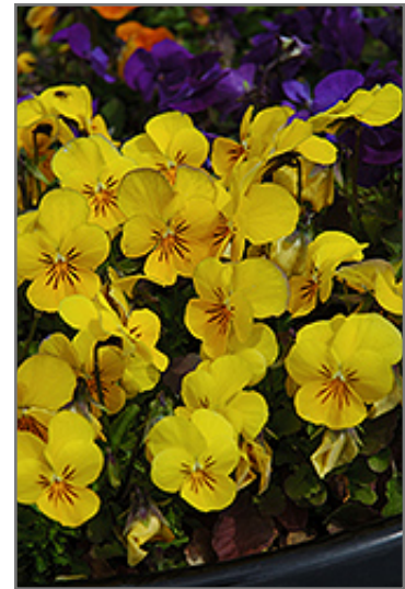
Penny Yellow Pansy flowers

This plant will require occasional maintenance and upkeep, and should only be pruned after flowering to avoid removing any of the current season's flowers. Deer don't particularly care for this plant and will usually leave it alone in favor of tastier treats. Gardeners should be aware of the following characteristic(s) that may warrant special consideration;