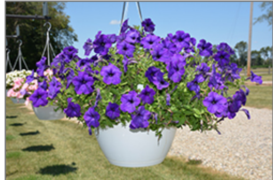
Main Stage Violet Petunia in bloom