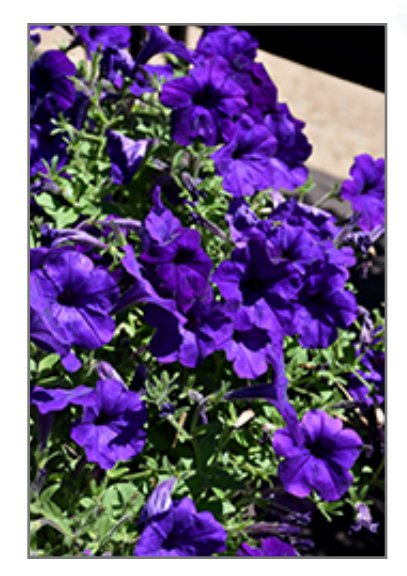
Main Stage Violet Petunia flowers

Main Stage Violet Petunia is a dense herbaceous annual with a trailing habit of growth, eventually spilling over the edges of hanging baskets and containers. Its medium texture blends into the garden, but can always be balanced by a couple of finer or coarser plants for an effective composition.