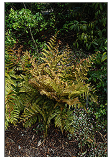
Autumn Fern