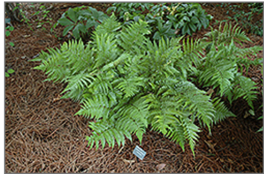
Autumn Fern

Autumn Fern will grow to be about 18 inches tall at maturity, with a spread of 18 inches. Its foliage tends to remain dense right to the ground, not requiring facer plants in front. It grows at a medium rate, and under ideal conditions can be expected to live for approximately 15 years. As an evergreen perennial, this plant will typically keep its form and foliage year-round.