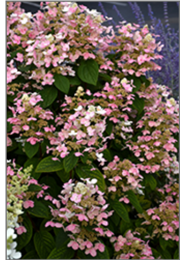
Quick Fire Hydrangea flowers