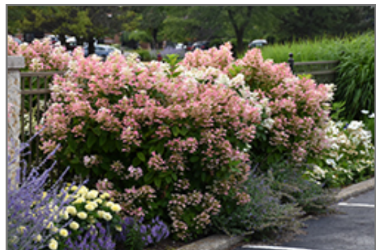
Quick Fire Hydrangea in bloom