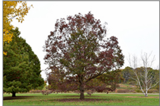
White Oak in fall

White Oak will grow to be about 90 feet tall at maturity, with a spread of 70 feet. It has a high canopy of foliage that sits well above the ground, and should not be planted underneath power lines. As it matures, the lower branches of this tree can be strategically removed to create a high enough canopy to support unobstructed human traffic underneath. It grows at a slow rate, and under ideal conditions can be expected to live to a ripe old age of 300 years or more; think of this as a heritage tree for future generations!