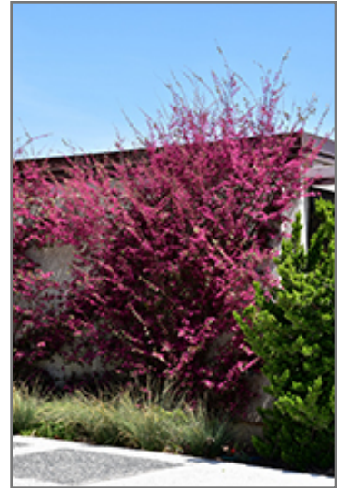
Red-Flowered Chinese Fringeflower in bloom

This shrub does best in full sun to partial shade. It prefers to grow in average to moist conditions, and shouldn't be allowed to dry out. It is particular about its soil conditions, with a strong preference for rich, acidic soils. It is somewhat tolerant of urban pollution. Consider applying a thick mulch around the root zone in winter to protect it in exposed locations or colder microclimates. This is a selected variety of a species not originally from North America.