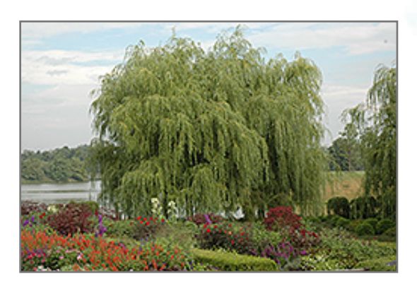
Golden Weeping Willow

Golden Weeping Willow is recommended for the following landscape applications;