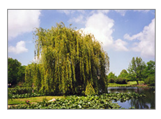
Golden Weeping Willow