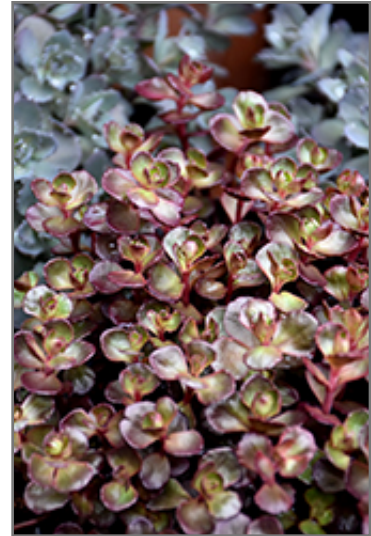
Voodoo Stonecrop foliage

Voodoo Stonecrop is recommended for the following landscape applications;