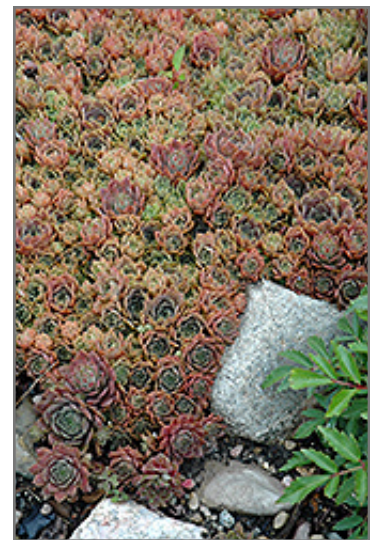
Silverine Hens And Chicks