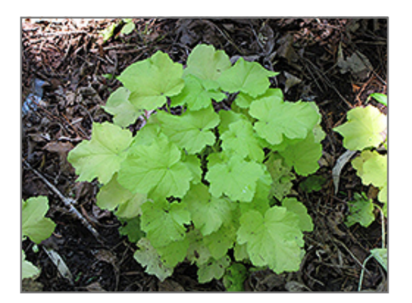
Citronelle Coral Bells