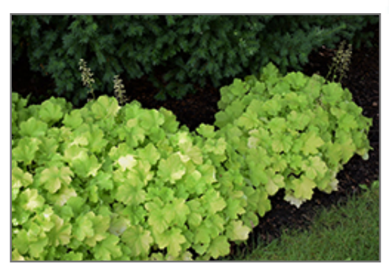
Citronelle Coral Bells in bloom

Citronelle Coral Bells will grow to be only 6 inches tall at maturity extending to 12 inches tall with the flowers, with a spread of 15 inches. When grown in masses or used as a bedding plant, individual plants should be spaced approximately 12 inches apart. Its foliage tends to remain low and dense right to the ground. It grows at a medium rate, and under ideal conditions can be expected to live for approximately 10 years. As an evegreen perennial, this plant will typically keep its form and foliage year-round.