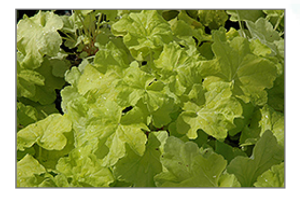
Citronelle Coral Bells foliage

This is a relatively low maintenance plant, and should be cut back in late fall in preparation for winter. It is a good choice for attracting hummingbirds to your yard. It has no significant negative characteristics.