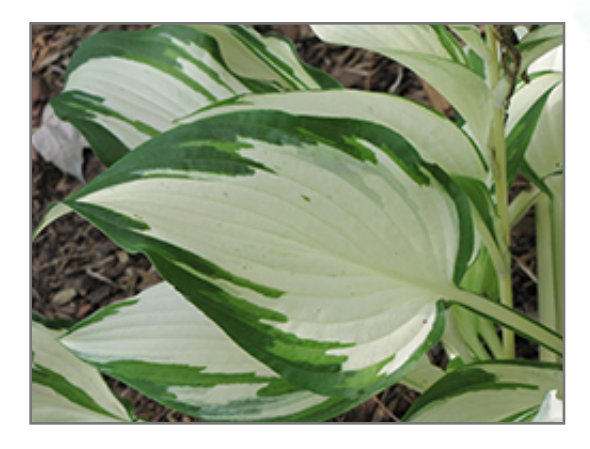
White Christmas Hosta foliage