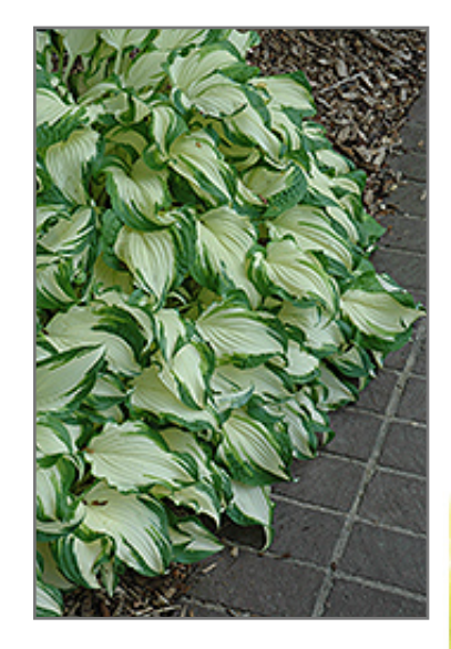
White Christmas Hosta foliage