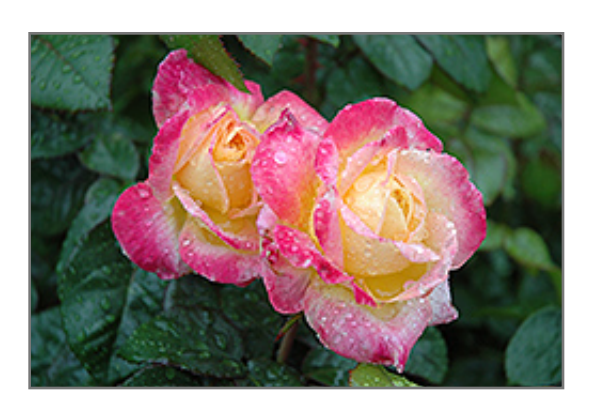
Love And Peace Rose flowers