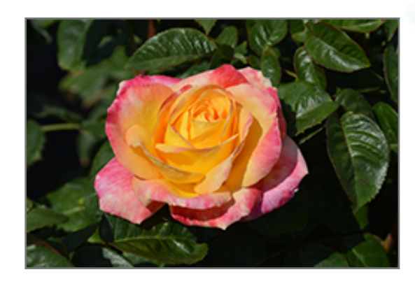
Love And Peace Rose flowers