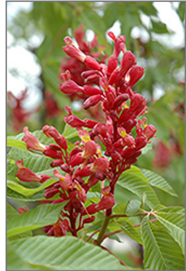
Red Buckeye flowers

Red Buckeye is recommended for the following landscape applications;