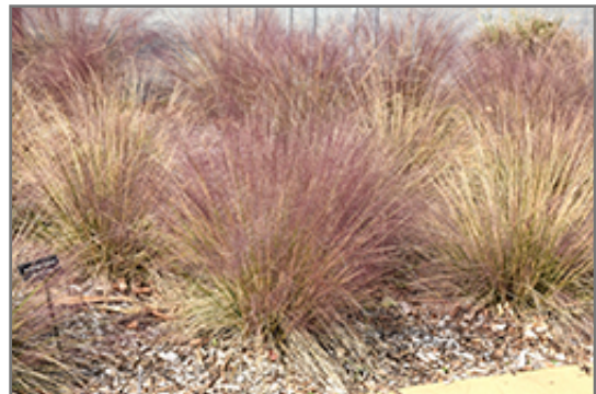
Hairawn Muhly in fall