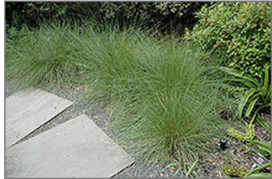
Hairawn Muhly

Hairawn Muhly is recommended for the following landscape applications;