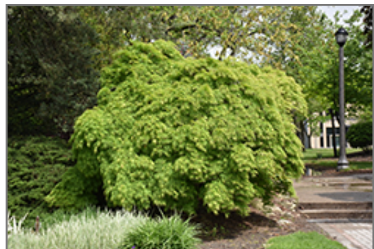
Cutleaf Japanese Maple