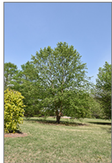
Dura Heat River Birch