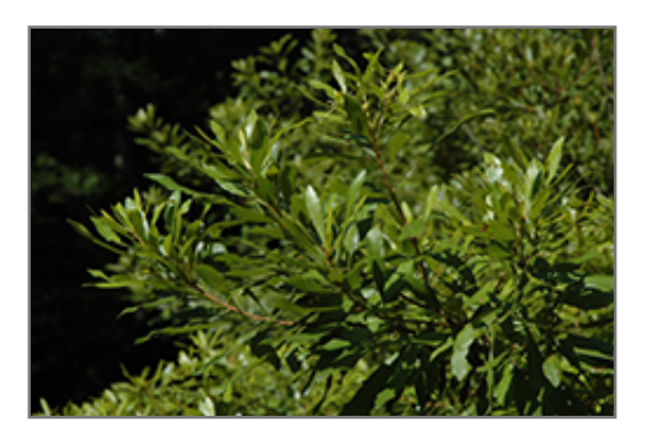
Southern Wax Myrtle foliage

Southern Wax Myrtle is primarily grown for its highly ornamental fruit. It features an abundance of magnificent blue berries from mid summer to mid fall. It features subtle chartreuse catkins along the branches from late winter to early spring. It has grayish green evergreen foliage. The fragrant narrow leaves remain grayish green throughout the winter.