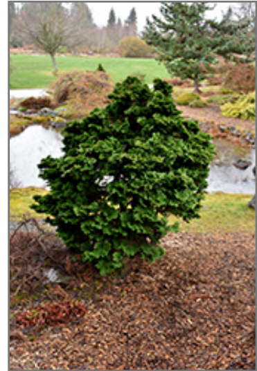
Dwarf Hinoki Falsecypress