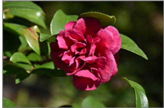
Bonanza Camellia flowers