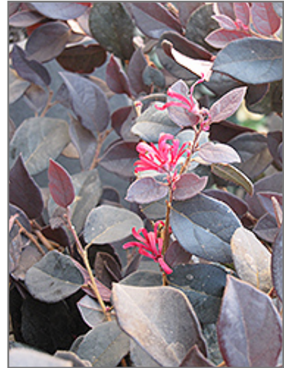
Purple Pixie Fringeflower flowers

Purple Pixie Fringeflower is recommended for the following landscape applications;