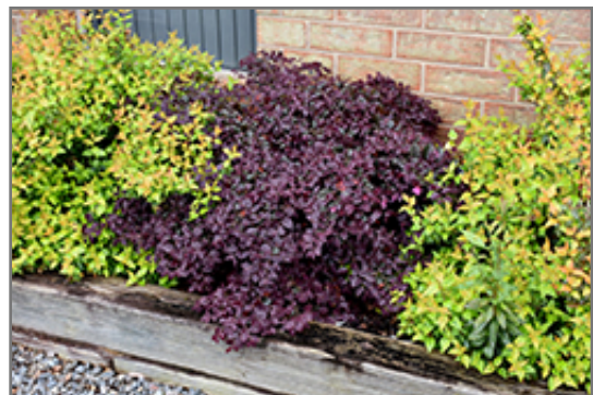
Purple Pixie Fringeflower