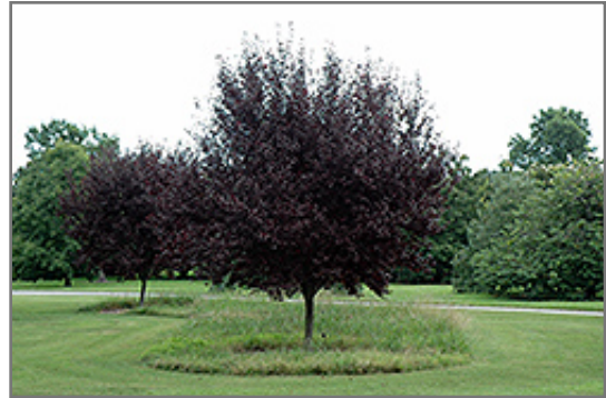
Krauter Vesuvius Plum

Krauter Vesuvius Plum will grow to be about 20 feet tall at maturity, with a spread of 12 feet. It has a low canopy with a typical clearance of 4 feet from the ground, and is suitable for planting under power lines. It grows at a medium rate, and under ideal conditions can be expected to live for approximately 30 years.