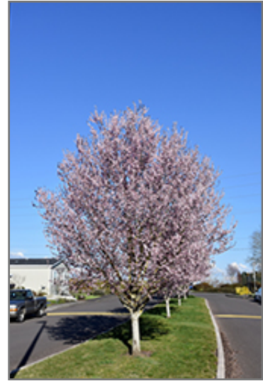
Krauter Vesuvius Plum in bloom

This tree will require occasional maintenance and upkeep, and is best pruned in late winter once the threat of extreme cold has passed. It is a good choice for attracting birds to your yard. Gardeners should be aware of the following characteristic(s) that may warrant special consideration;