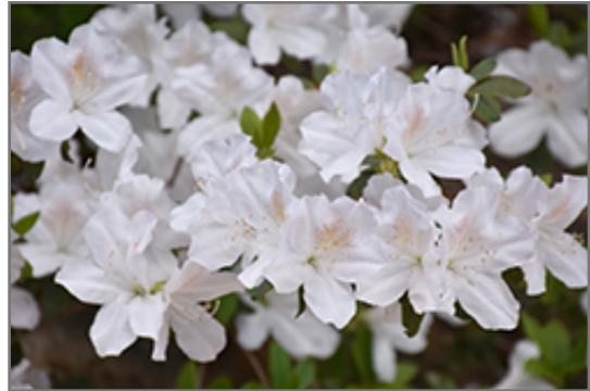
Delaware Valley White Azalea flowers