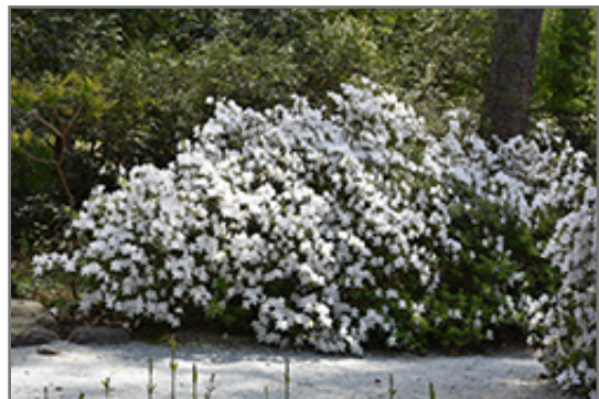
Delaware Valley White Azalea in bloom