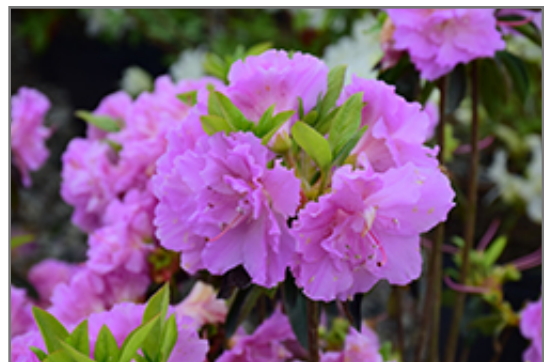
Elsie Lee Azalea flowers