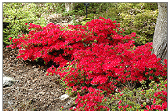
Hino Crimson Azalea in bloom