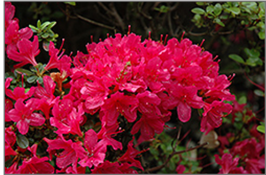
Hino Crimson Azalea flowers

This shrub does best in full sun to partial shade. You may want to keep it away from hot, dry locations that receive direct afternoon sun or which get reflected sunlight, such as against the south side of a white wall. It requires an evenly moist well-drained soil for optimal growth, but will die in standing water. It is very fussy about its soil conditions and must have rich, acidic soils to ensure success, and is subject to chlorosis (yellowing) of the foliage in alkaline soils. It is somewhat tolerant of urban pollution, and will benefit from being planted in a relatively sheltered location. Consider applying a thick mulch around the root zone in winter to protect it in exposed locations or colder microclimates. This particular variety is an interspecific hybrid.