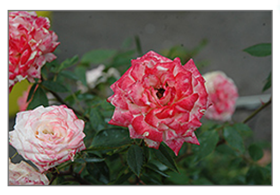
Minnie Pearl Rose flowers

A vigorous miniature variety with dark green leaves and blooms with recurved petals that are shades of shell pink with deeper pink tips; a dramatic color display that is excellent for smaller garden areas, groundcover and planters