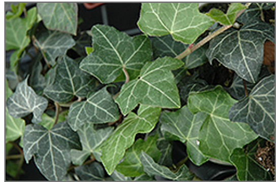
Baltic Ivy foliage